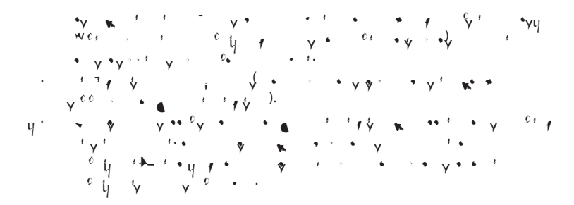
Important note: Some graduate programs require students to write the GRE (General and/or subject test). It is recommended that students consider writing the GRE (General Test) in the summer before their last academic year and the subject GRE (if required) in the fall of their last academic year.